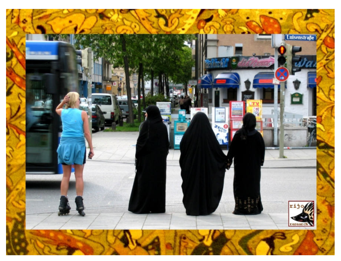
Thrice overdressed, once underdressed