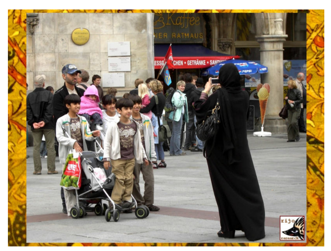
Mom is taking a picture on Marienplatz