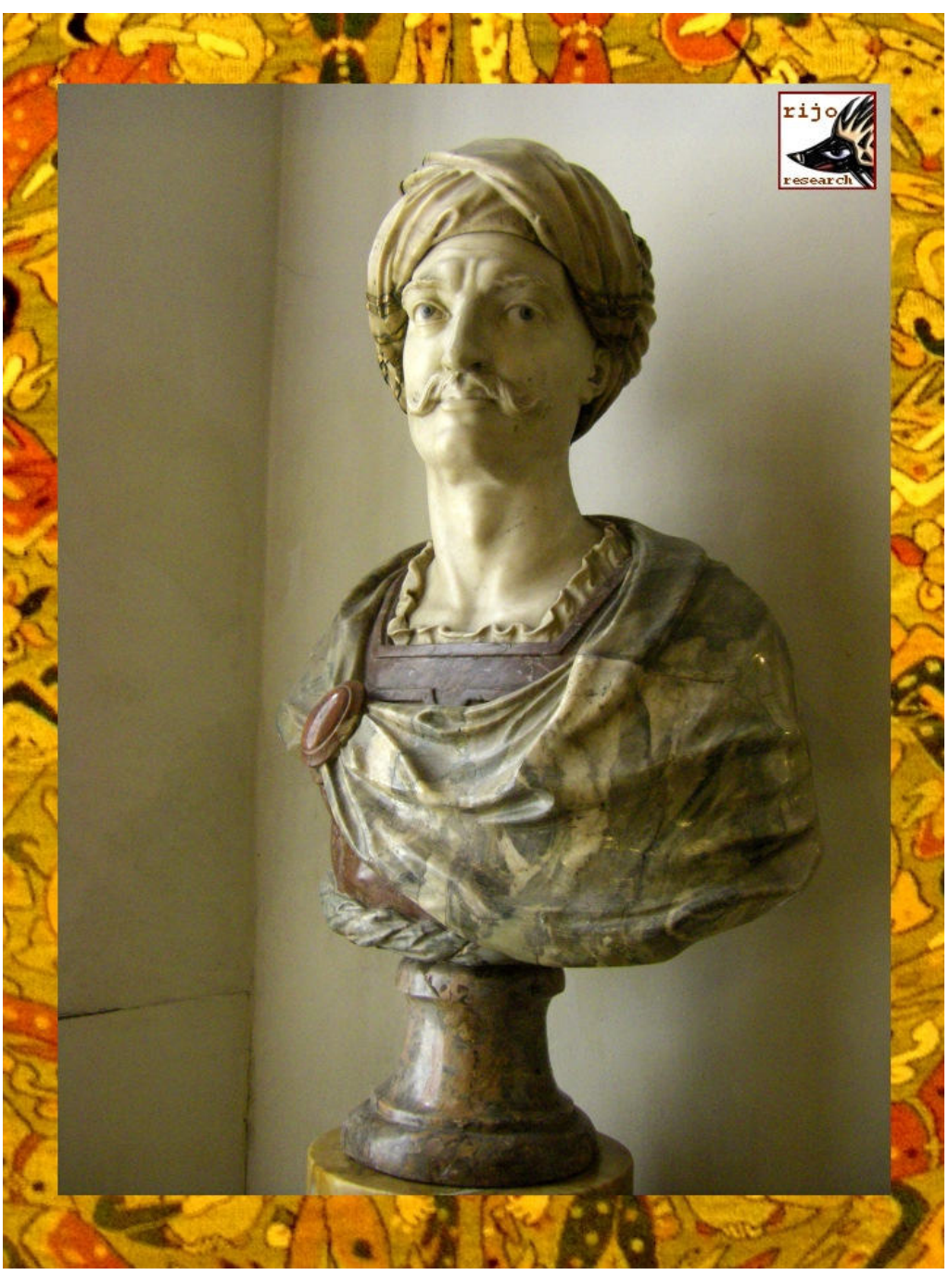
Bust of an oriental dignitary in the former Royal Palace

Photographic traces of the sons and daughters of the dessert or their effigies in Munich