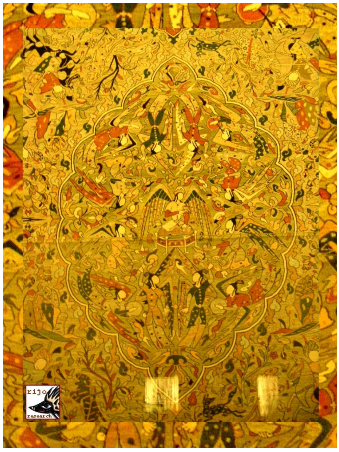
So called Polish Carpet , actually a Persian rug from the 17^{\rm th} century in the former Royal Palace