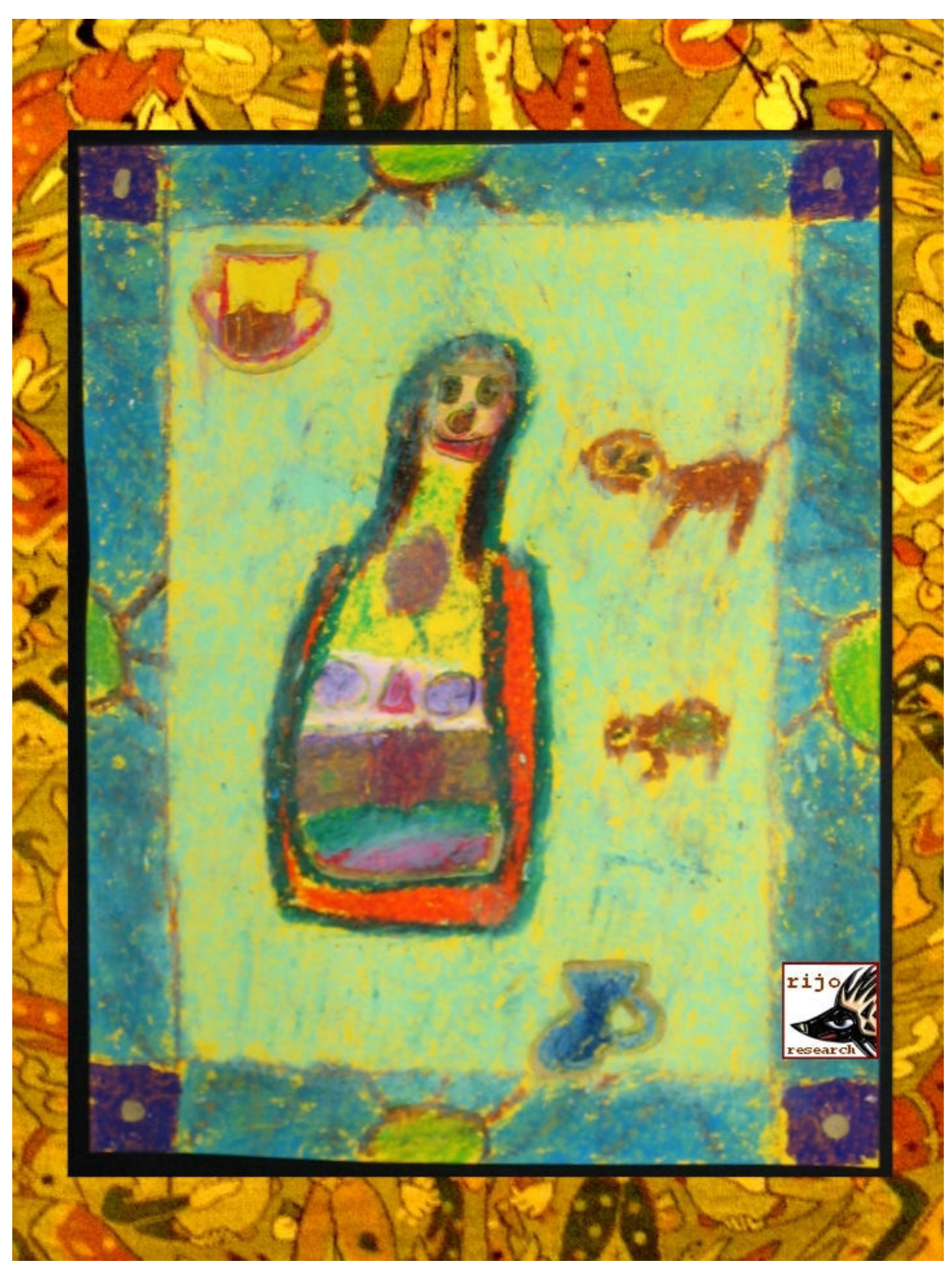
An elementary school student's drawing of a smiling mummy