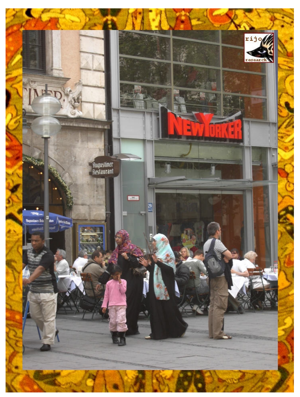
Female Arabs in Munich's pedestrian zone