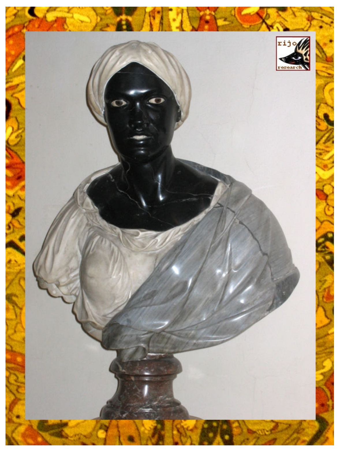
Bust of a moor in the former Royal Palace