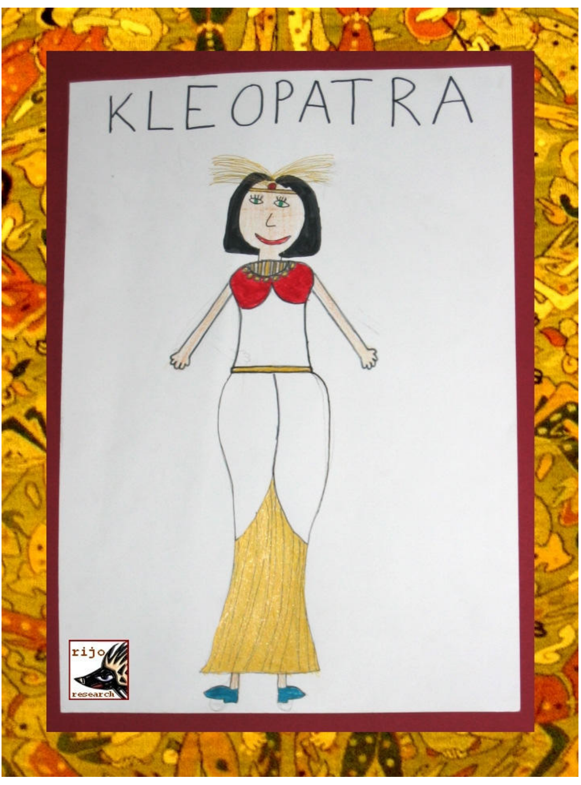
An elementary school student's drawing of Egypt's Queen Cleopatra