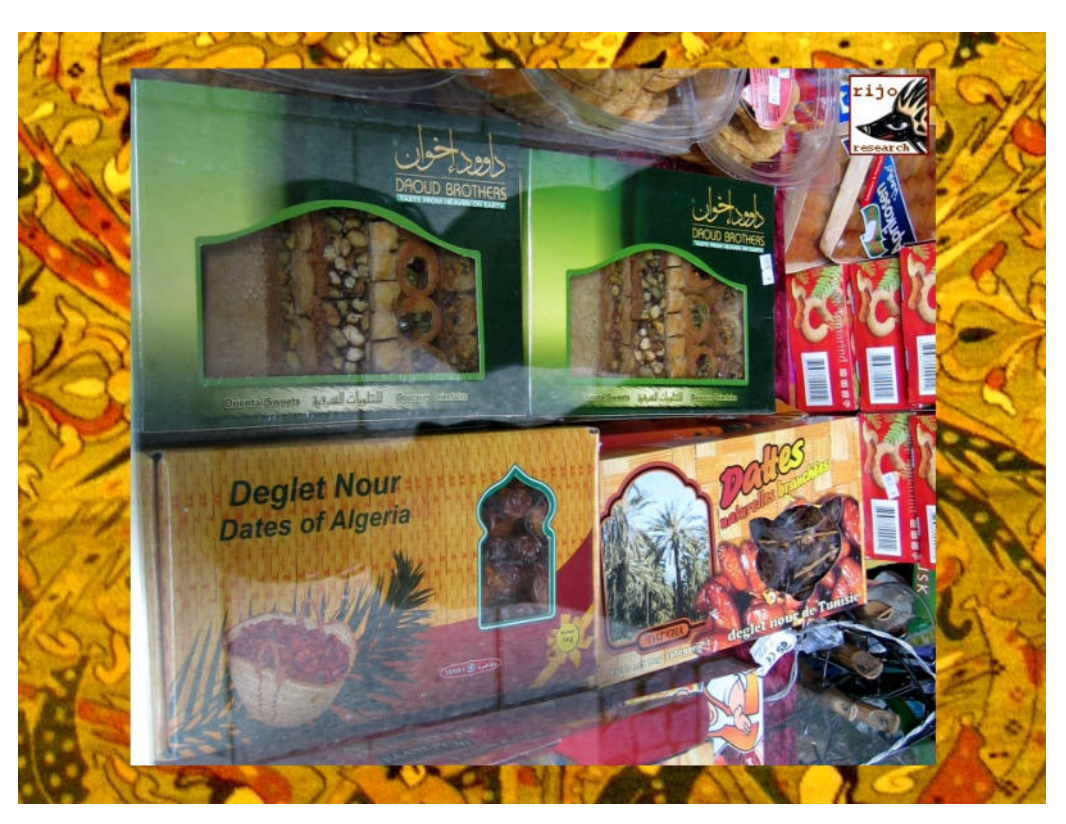
Shop window with oriental sweets on display