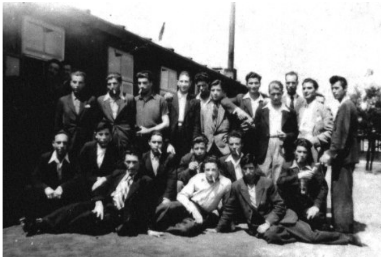
Greek forced laborers in Nuremberg after their liberation in April 1945

The most severe result from this racial and ideological pyramid for each individual was the exemption from regular jurisdiction of the German courts. Even the civilian workers from France or Belgium privileged in comparison to the Eastern Europeans, were exposed defenselessly to Gestapo and SS by criminal law. (see below chapter about the correction camp Langenzenn).