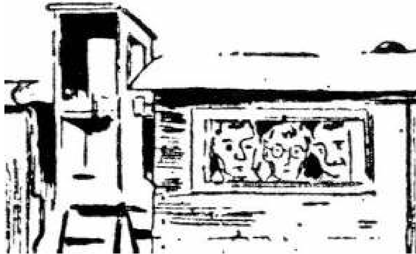
The arrival of Dutch forced laborers in Nuremberg (Sketch: Guust Hens)