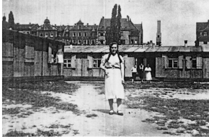
Female Ostarbeiter in a Nuremberg labor camp