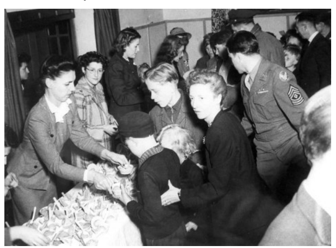
Wives of officers and enlisted men act as hostesses at the grand opening of the Erlangen Youth Center, which is operated by the Erlangen Air Force.