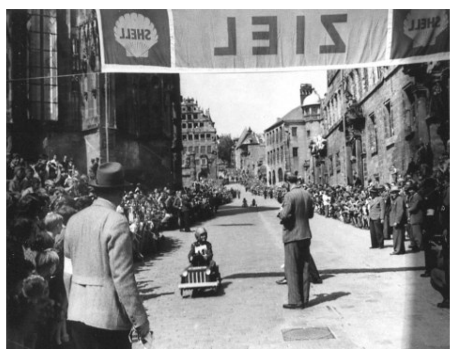
A soap box derby, sponsored by German Youth Activities, with the help of various German industries, was held for German children in Nurnberg on 29 May. Young dare devil wins the third race in his midget car.