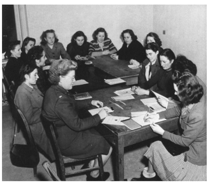
Twelve members of the GYA prepare to write the constitution for GYA Center no. 1, Nurnberg, Germany. The constitution will be put to a vote before the members of the club as soon as it is prepared. The Nurnberg girls council has spent the last eight months studying "democratic practice" before undertaking this important step in the foundation of the club. Three of the officials of the club [GYA] help the girls put it in writing. (Source: NA RG 111 SC 1941-54, Box 141, 294874, 15 Dec. 1947)

On the lighter side, American women introduced German girls to the mysteries of being what was considered to be a modern woman at the time. A zone wide GYA publication, The Idea Exchange reported in December 1947 that