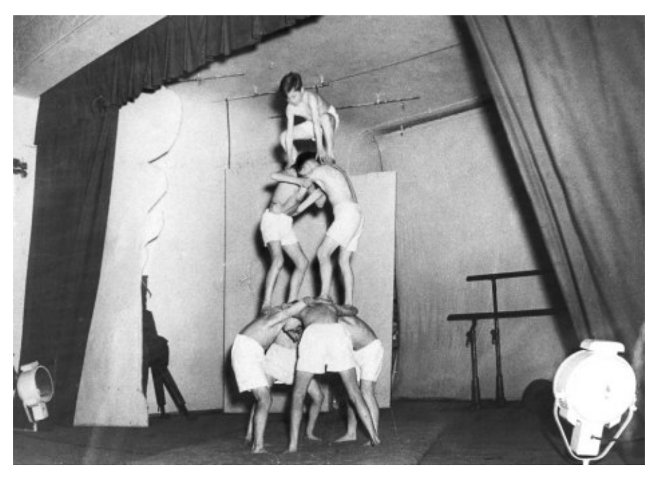
This acrobatic act is staged at the opening night of the Erlangen youth center. More than 2,000 youths belong and it is operated by the Erlangen Air Force.

In spite of never ending obstacles, many units in the Post area emulated the example which the GYA center in Nuremberg set for them. Erlangen, for example, opened its own youth facility in March 1947. It featured a library of over 5,000 volumes, a sports clinic, and, from May 1948 on, its own 35 mm film hour. Together with most units in the area the local GYA offered summer camps for needy children and had a publication to disseminate its news. Like many others, the managers of the Erlangen center found that a garden project appealed to its patrons. But Erlangen also developed its own initiatives: The local GYA chapter introduced youth day rooms which permitted working mothers who did not have a husband to leave their children under supervised care. "Many and urgent requests" caused the local Post to expand this part of its program in 1948. By June GYA Erlangen was providing day care facilities for 160 children.<sup>35</sup>