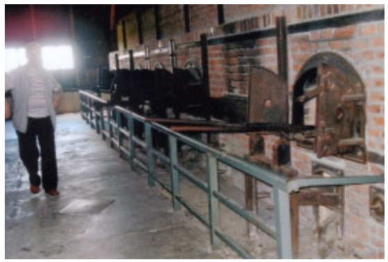
Front of the ovens