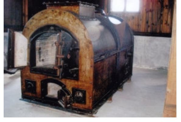
Single oven; when Majdanek started operating this oven was used