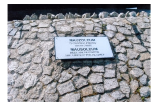
Plaque at the mausoleum in Majdanek