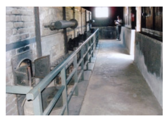
Rear of the ovens where ashes were removed