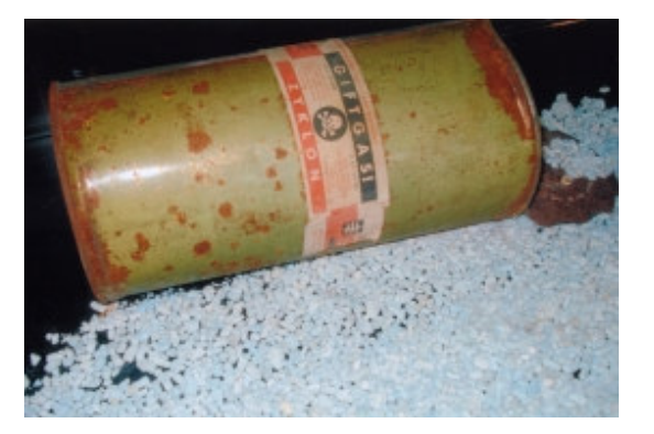
Zyklon B poison gas canister