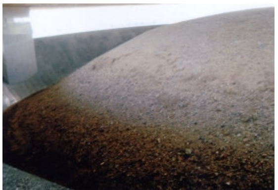
Mausoleum with ashes and small bones