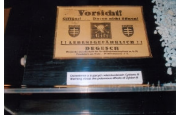
Warning about the poisonous effects of Zyklon B