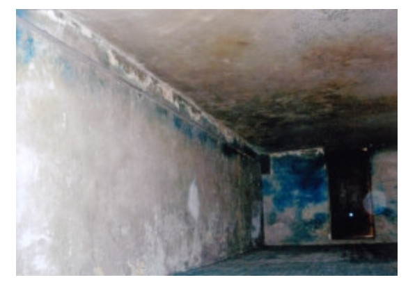
Gas chamber; blue color is residue of Zyklon B poison gas