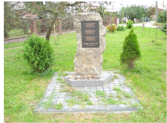
Memorial for the Jews deported from Franconia