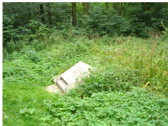
The Jewish cemetery