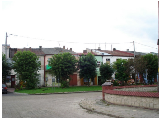
Town center of Izbica