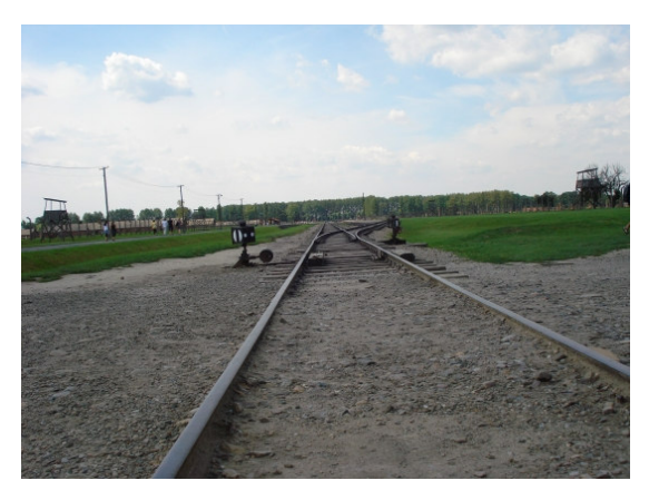
Railway tracks at Birkenau