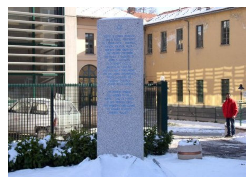
Memorial in Borgo San Dalmazzo for the Jews deported from there to Auschwitz

In a short while, on November 24, 1943, my father was delivered to the infamous transit camp Drancy. My father's luck had finally run out. I very much admire his resourcefulness, his ability to stay a free man, his resolve to stay out of internment camps and his determination to reach a save haven outside of France.