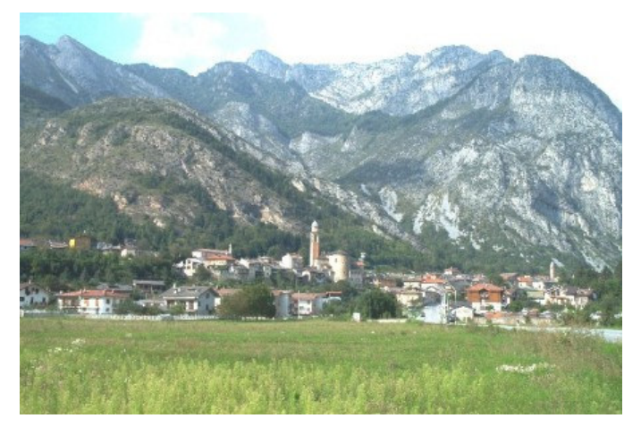
Valdieri

Finally after leaving the foothills of Parco delle Alpi Marittimi my father found himself in the valley close to the town of Valdieri. The refugees scattered among the little towns or sought shelter with friendly farmers. In many cases the refugees were hidden or were given sanctuary by the local priests. All indications are pointing to my father staying in the town of Valdieri or its close proximity. It must be stated that the local population of this area helped many Jewish refugees to survive.