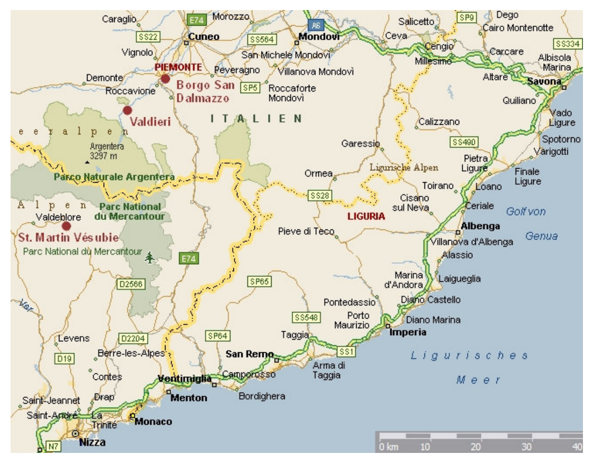
The places of Ferdinand Glaser's failed flight on both sides of the French-Italian border

The records of General Command, II SS Armored Corps from the Bundesarchiv-Militärarchiv in Freiburg (RS 2-2/21, part 2) contain clear indications that Peiper's unit was actively and directly involved in the arrests. This action is laconically reported in the Kriegstagebuch (war diary) of the "Generalkommando II. SS-Panzerkorps" (the "1. SS-Panzer-Grenadier Division Leibstandarte Adolf Hitler" was a unit of this corps).