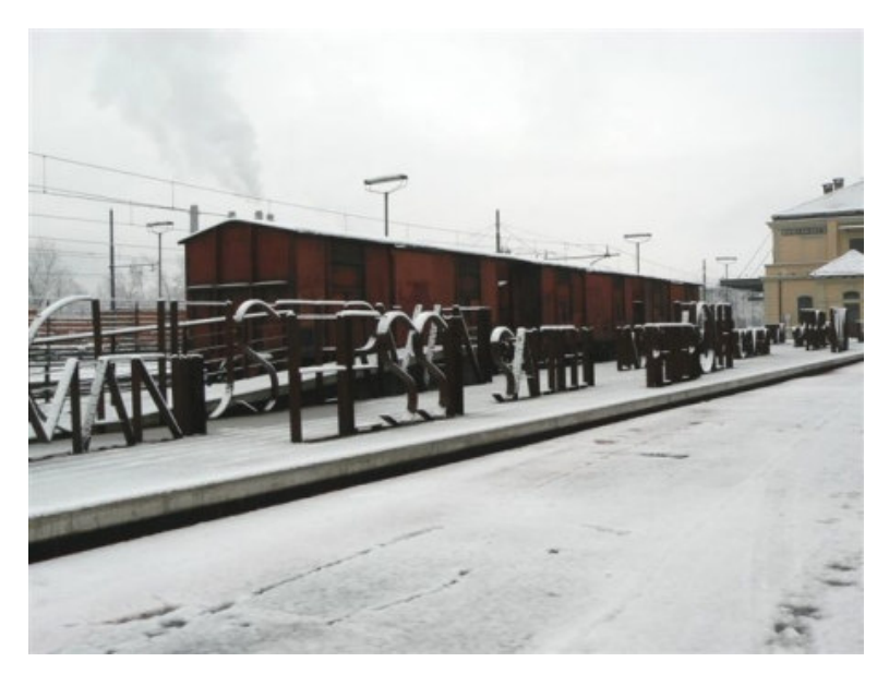
Memorial for the deported Jews at Borgo San Dalmazzo railway station