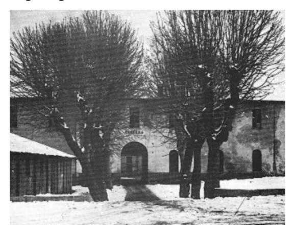
Military barracks in Borgo San Dalmazzo

My father and 349 Jewish refugees, 148 women and 201 men, held now in the detention camp in Borgo San Dalmazzo since September 18, 1943, had no idea what was in store for them. It is remarkable that a document from the city archives in Borgo San Dalmazzo reveals that Ferdinando Glaser was drawing a cigarette ration while in the detention camp.