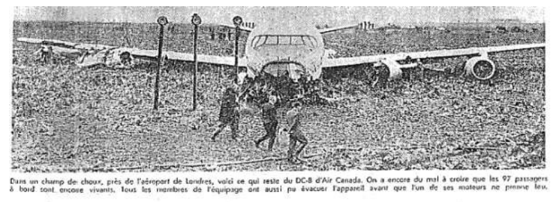
Grace à l'équipage d'un BC-8 d'Air Canada 97 passagers échappent à une mort certaine

When in November 1963 my wife and I traveled with a TCA plane on a return trip from London to Montreal, this plane crashed on take off near the London airport. My mother's guardian angel was riding co-pilot and protected us from a fiery death.