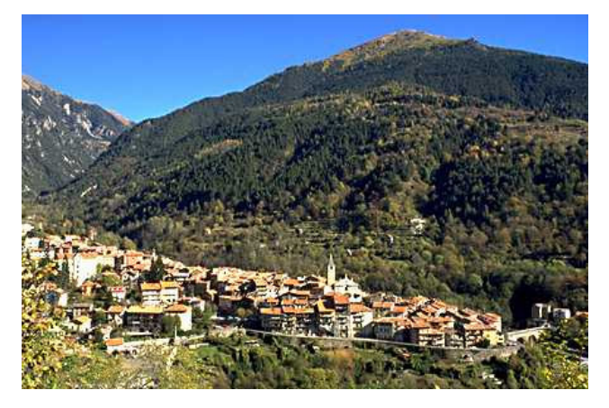
St. Martin Vésubie

St. Martin was like a magnet for the Jewish refugees and some 1,000 Jewish refugees found a haven in St. Martin.