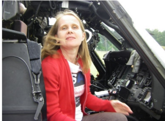
... and the changing contents of their cockpits