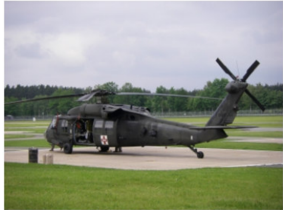
Choppers in Graf, now and then...