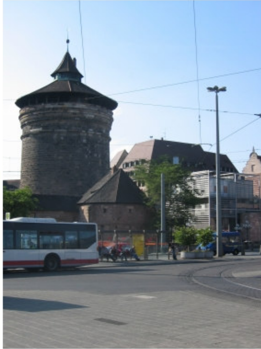
Königstor gate looking inside the Old Town