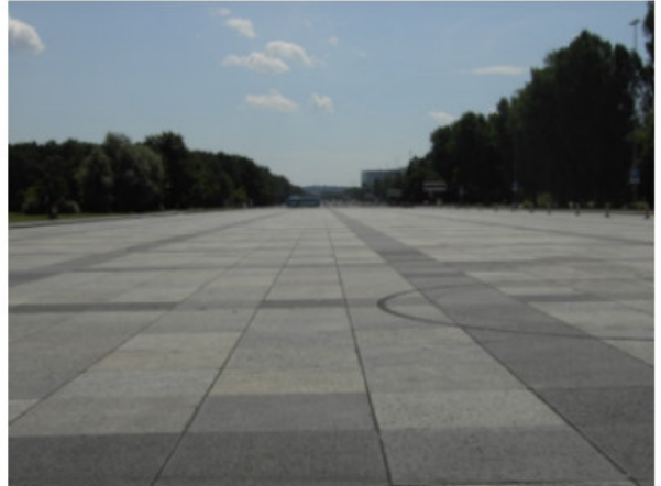
Große Straße parading area at the Nazi party rally grounds