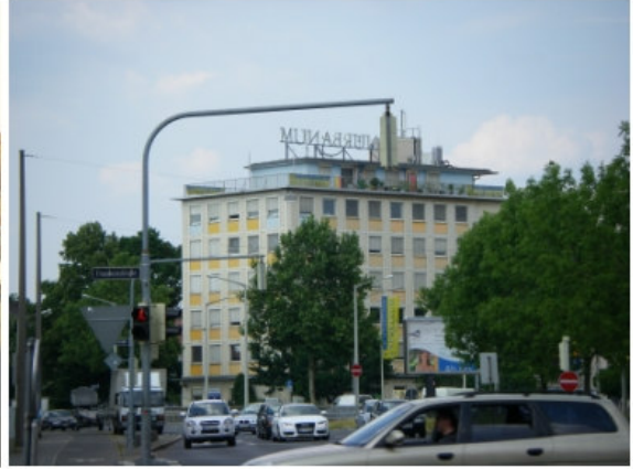
View from Tom's room on the first floor of the west square of Merrell looking down Allersberger Straße