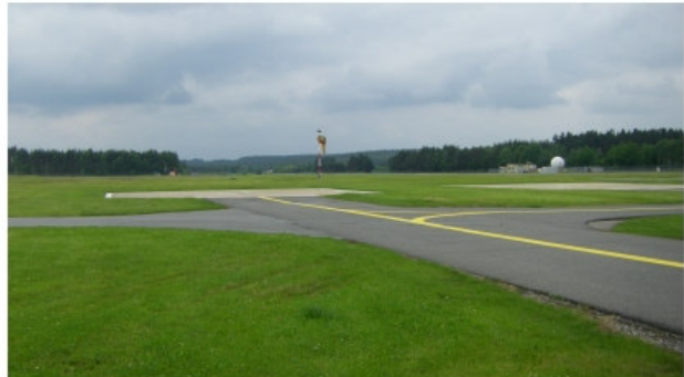
Runways at Graf airfield