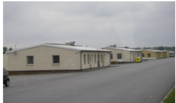
Graf HQ for the 3/17 th Field Artillery / Installations there today