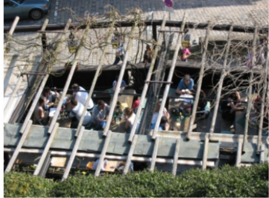
Beer garden beneath the castle