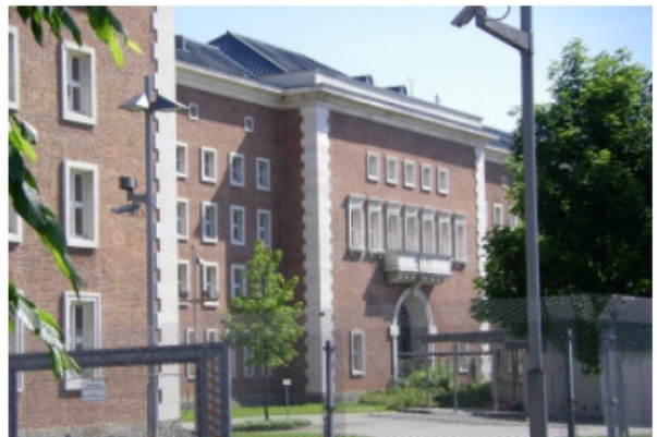
Main Gate of Merrell Barracks inside looking out