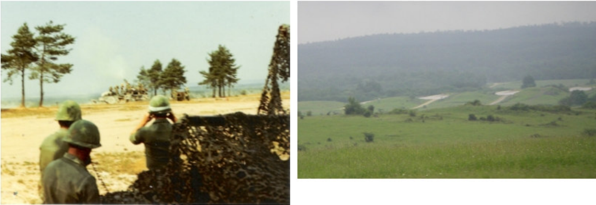
An 8 inch projectile just fired from a cannon / Artillery ranges today