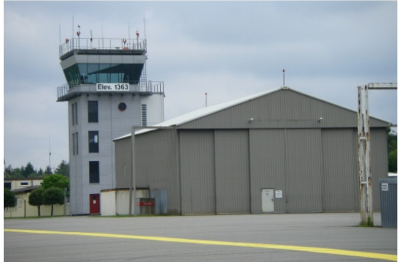
The control tower of Graf airfield