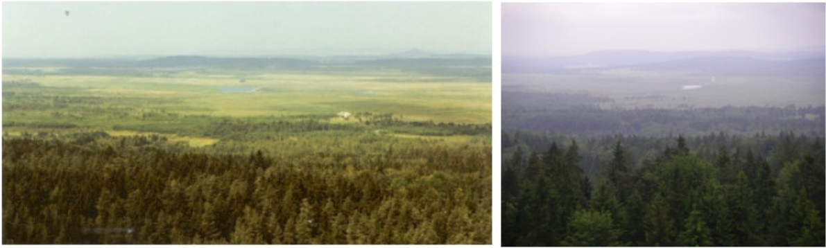
Impact Area at Graf (photos: Tom Spahr 1971 / Susanne Rieger 2010)