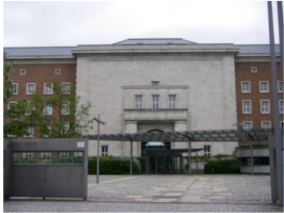
Main Gate of Merrell Barracks outside looking in