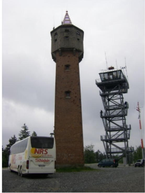
Bleidorn Observation Tower, a landmark of the training area