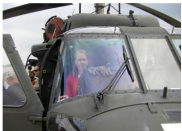
Two wannabe pilots in a chopper at Graf airfield