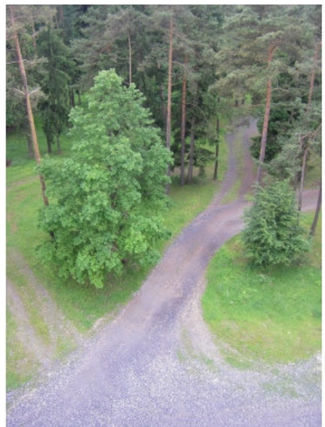
Looking down Bleidorn Tower