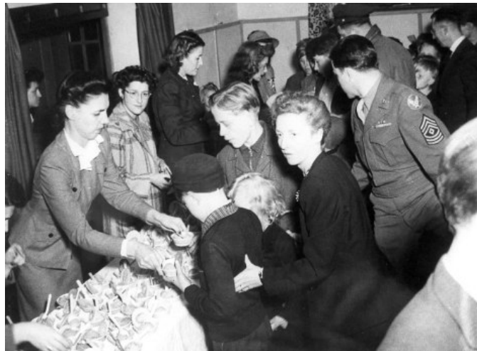
Wives of officers and enlisted men act as hostesses at the grand opening of the Erlangen Youth Center, which is operated by the Erlangen Air Force.