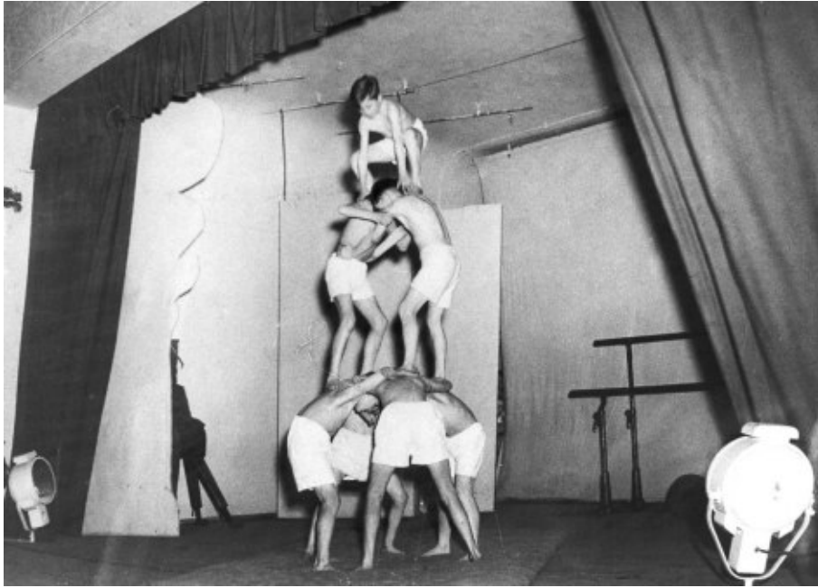
This acrobatic act is staged at the opening night of the Erlangen youth center. More than 2,000 youths belong and it is operated by the Erlangen Air Force.

In spite of never ending obstacles, many units in the Post area emulated the example which the GYA center in Nuremberg set for them. Erlangen, for example, opened its own youth facility in March 1947. It featured a library of over 5,000 volumes, a sports clinic, and, from May 1948 on, its own 35 mm film hour. Together with most units in the area the local GYA offered summer camps for needy children and had a publication to disseminate its news. Like many others, the managers of the Erlangen center found that a garden project appealed to its patrons. But Erlangen also developed its own initiatives: The local GYA chapter introduced youth day rooms which permitted working mothers who did not have a husband to leave their children under supervised care. "Many and urgent requests" caused the local Post to expand this part of its program in 1948. By June GYA Erlangen was providing day care facilities for 160 children. 35