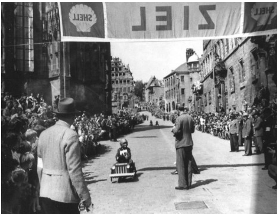
A soap box derby, sponsored by German Youth Activities, with the help of various German industries, was held for German children in Nurnberg on 29 May. Young dare devil wins the third race in his midget car.